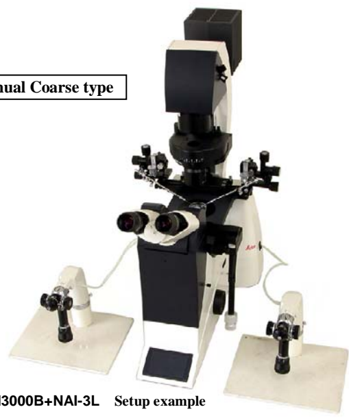
DMI3000B+NAI-3L Setup example